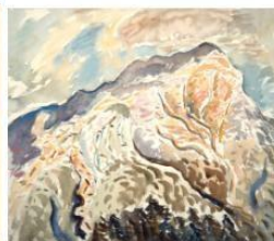
Louis Kahn, Mountain N°1, Woodstock, New York 1934 - 1935