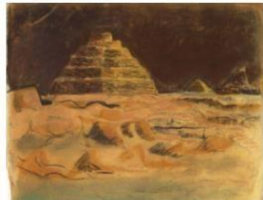
Louis Kahn, Stepped Pyramid, No.2, Saqqara, Egypt 1951