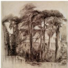
Louis Kahn, Gabled Manor, England 1928